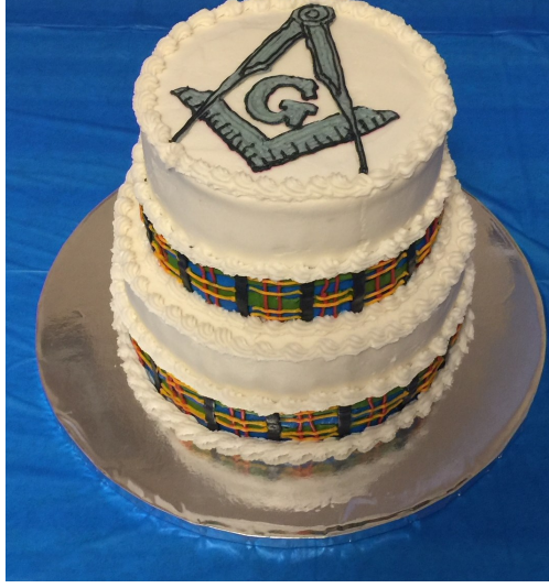
Robert Burns Night Cake contributed by WSL60 WM for our Scottish meal before January Stated Communication

To Ride Share.... Contact the Lodge Secretary