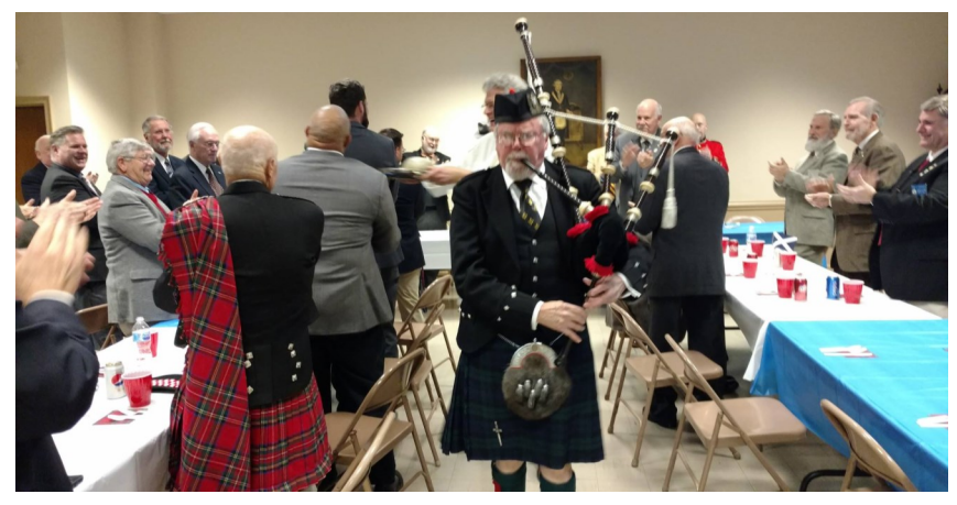
Piping in the Haggis.... Burns Night Celebration -January Stated Meal